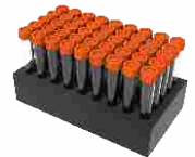
45 x 15 ml tubes