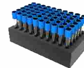
60 x 7 ml tubes