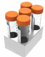
5 x 50 ml Block