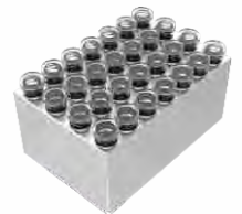
28 x 1.5/2 ml Block