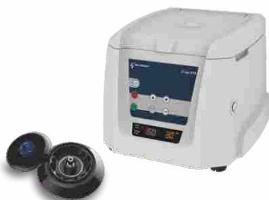
Table Top Genius

Max. 15000 RPM (15596g), 12 x 1.5 / 2 ml