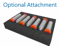
7 x 50 ml Quechers assay