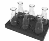
6 x 250 ml flasks