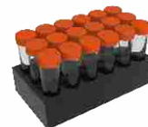
18 x 50 ml tubes