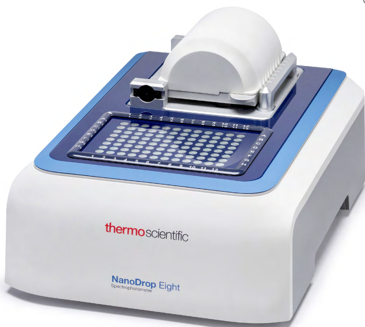
NanoDrop Eight 8-channel Microvolume UV-Vis Spectrophotometer

The NanoDrop Eight Spectrophotometer accurately measures a wide concentration range for protein samples using a 1 to 2 \mu\text{L} sample size. The auto-ranging pathlength technology on the NanoDrop Eight instrument pedestals allows life scientists to measure samples in an expanded concentration range, eliminating the need for error-prone dilutions. The 8-channel pedestal system on the NanoDrop Eight Spectrophotometer allows for simple implementation in high throughput workflows and includes a quick measurement time of about 15 seconds. The accuracy was evaluated by comparing several protein dilutions measured on the NanoDrop Eight Spectrophotometer with the NanoDrop 8000 Spectrophotometer as a reference. Reproducibility for each protein dilution was calculated from concentration data obtained by the NanoDrop Eight instrument.